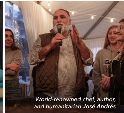
World-renowned chef, author, and humanitarian José Andrés