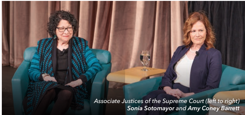
Associate Justices of the Supreme Court (left to right) Sonia Sotomayor and Amy Coney Barrett

Interact with, and learn directly from, the world's most influential entrepreneurs, scientists, journalists, and leaders of our time.